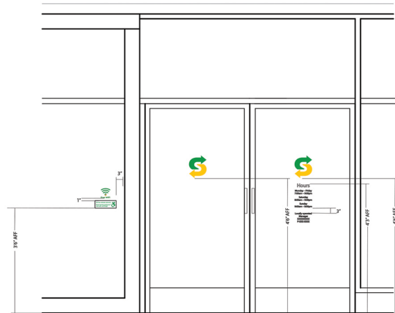
Double Doors with Side Handles

Additional Choice Mark can be purchased to apply on the additional door panel.